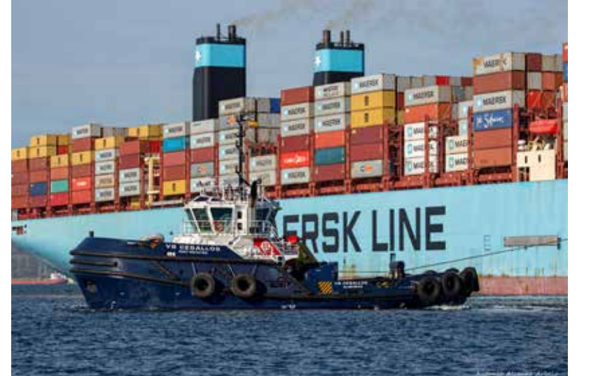
The Spanish tug Ceballos pulling a Lankhorst rope