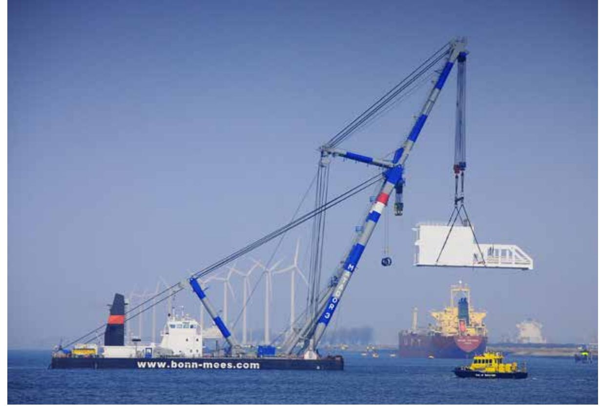
Lankhorst Ropes supplies the heavy lift industry with their products

The company is part of the world's largest steel wire manufacturers, WireCo WorldGroup.